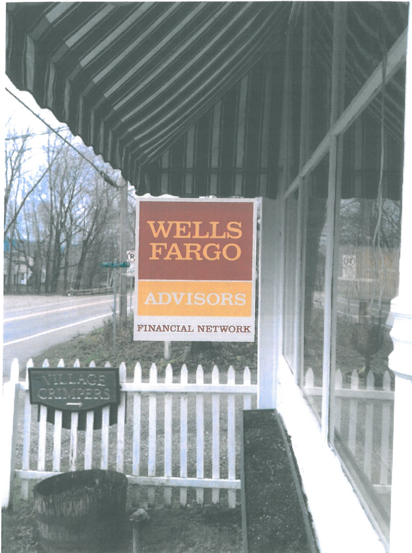
36" x 43" 2-SIDED CARVED SIGN